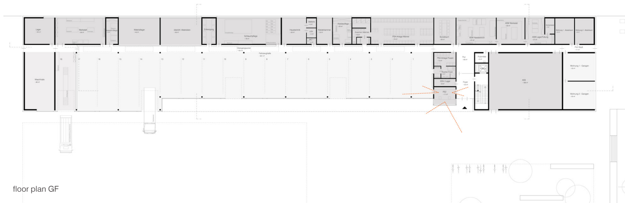
floor plan GF