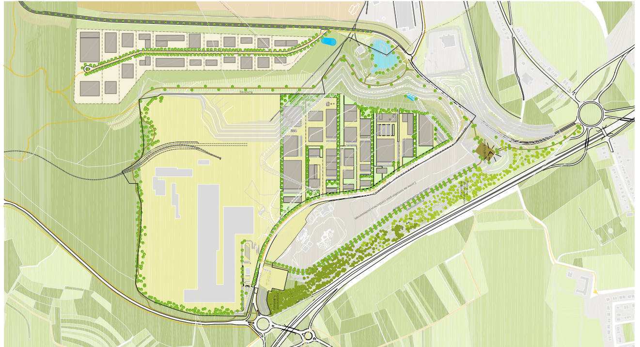
Plan Directeur (Masterplan)