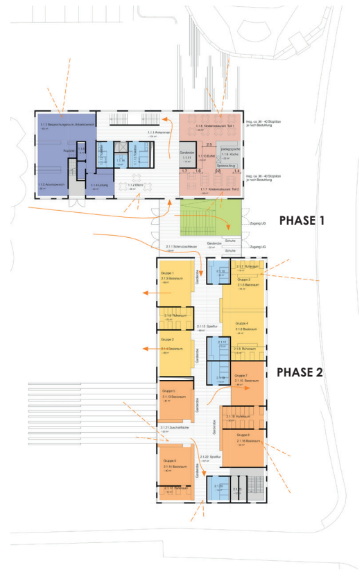
ground floor / street level