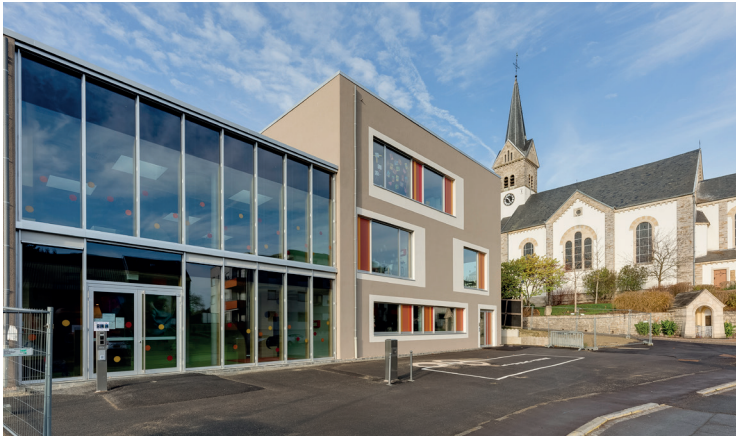
phase 1 - new school centre

The façade seamlessly blends in with the heterogeneous surroundings of the town centre and in fact takes more of a back seat thanks to its modestly designed plaster façade. At the same time, it does make an impact through the colour scheme of its window elements and lends a contemporary school character to the building.