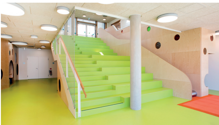
foyer /play area