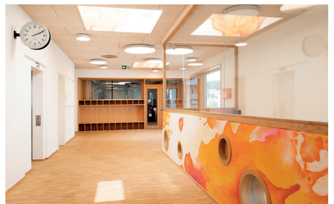
stairwell with wall-art